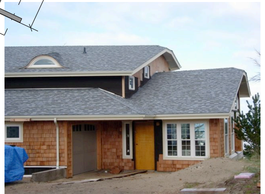
Under Construction Waldport, OR